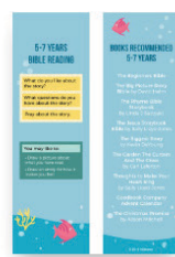
5-7 Years Bookmark