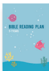
5-7 Years Plan