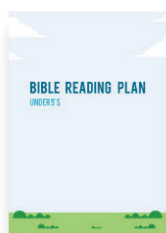
Under 5s Plan