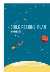
8-11 Years Plan