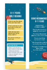
8-11 Years Bookmark