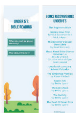
Under 5s Bookmark